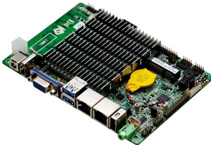
EPIC-E19_J126L VER:1.1 side view