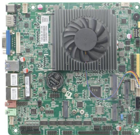
ITX-B305_I326L VER:1.0 主板正面图