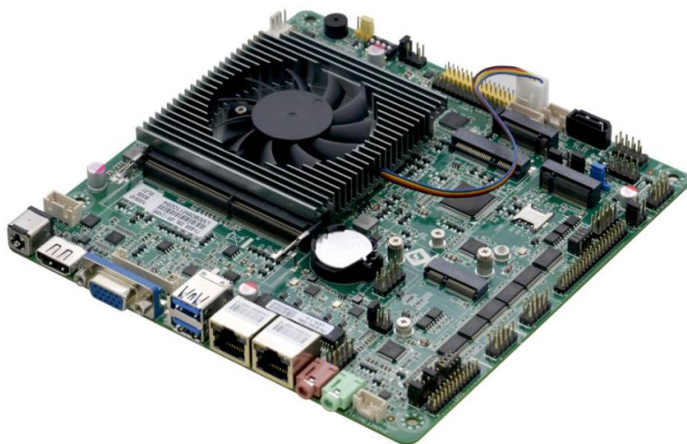
ITX-B305_I326L VER:1.0 主板侧面图