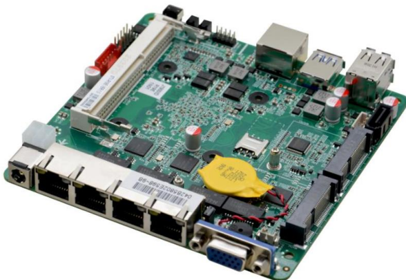
STX-R19E VER:1.0 主板侧面图