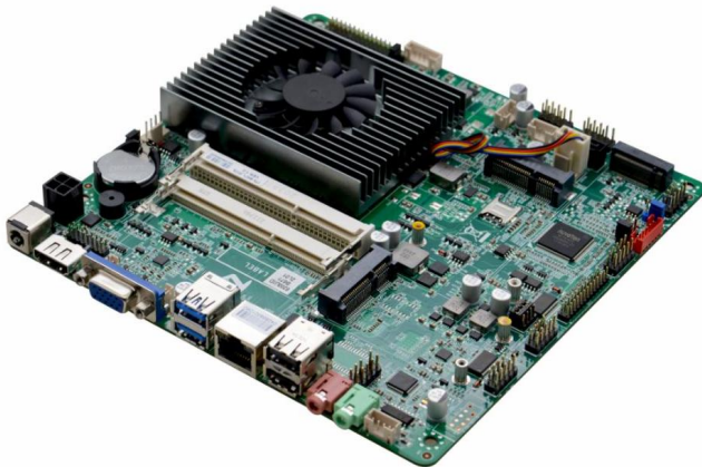
ITX-B671_I512L VER:1.0 主板侧面图