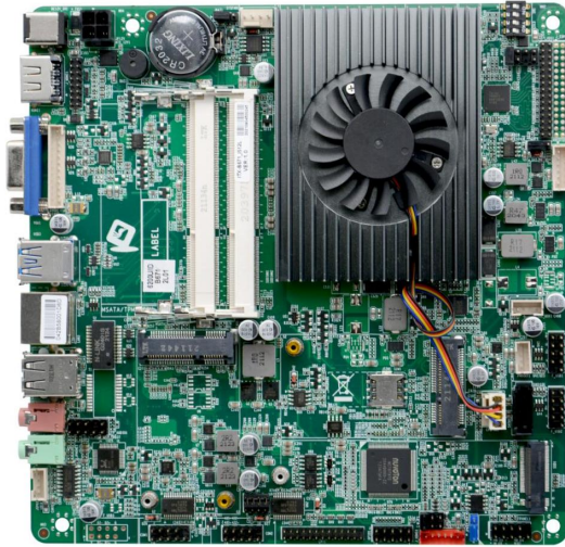
ITX-B671_I512L VER:1.0 主板正面图