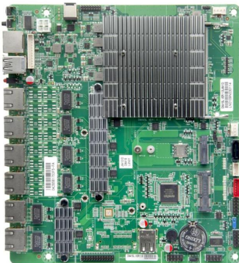
D641SL VER1.0 主板正面