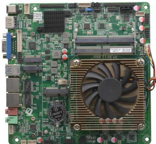
ITX-FT20 VER:1.1 主板正面图