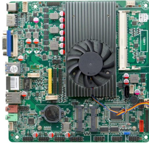
ITX-B321_I512L VER:1.0 主板正面图