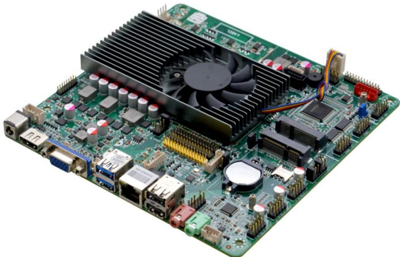
ITX-B321_I512L VER:1.0 主板侧面图