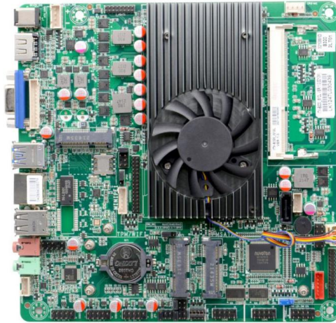
ITX-B320_I512L VER:1.0 主板正面图