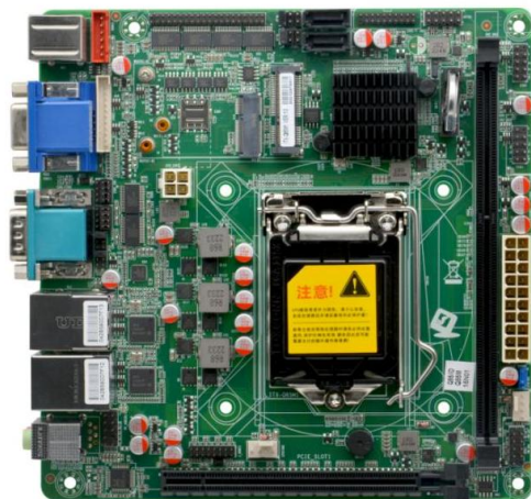
ITX-Q85M1 VER:1.0A 正面图