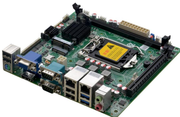
ITX-Q85M1 VER:1.0 侧面图